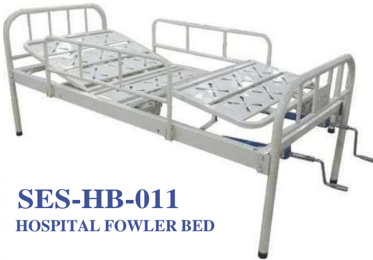
SES-HB-011 HOSPITAL FOWLER BED