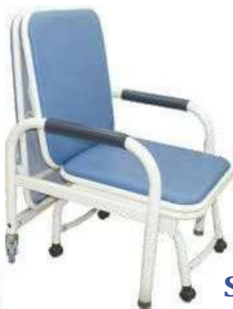
SES-HFC-002 ATTENDENT BED CUM CHAIR