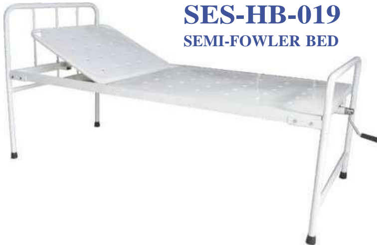
SES-HB-019 SEMI-FOWLER BED