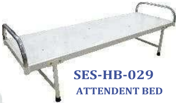
SES-HB-029 ATTENDENT BED