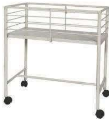
BABY COT SES-BC-003