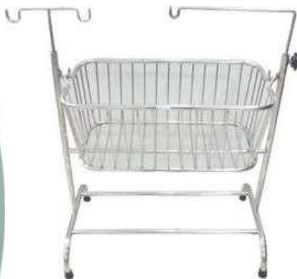
BABY CRADLE SS SES-BC-002