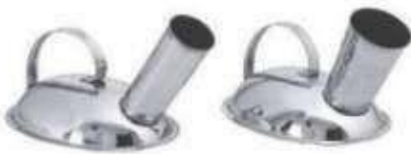
URINAL POT SS