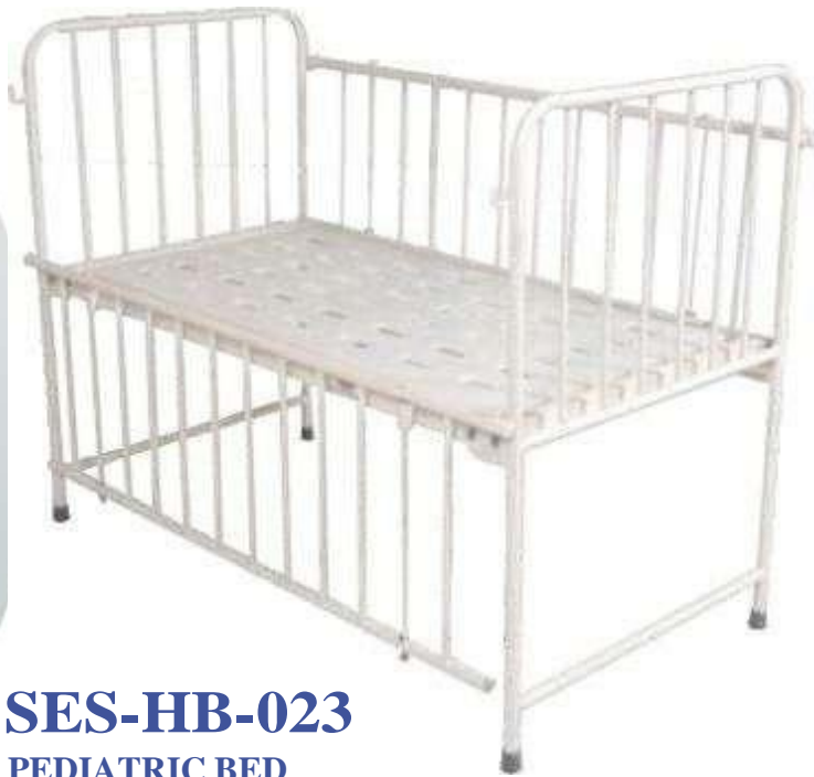
SES-HB-023 PEDIATRIC BED