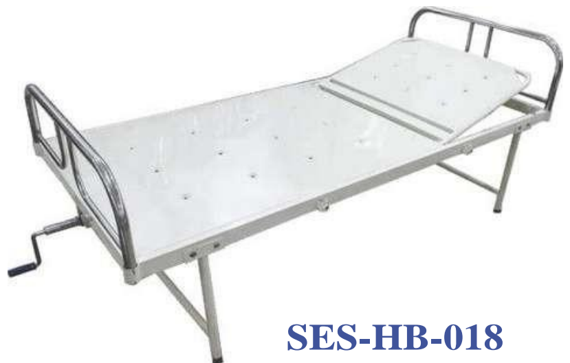
SES-HB-018 SEMI-FOWLER BED