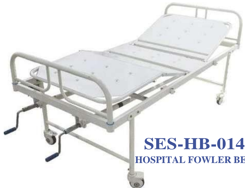
SES-HB-014 HOSPITAL FOWLER BED