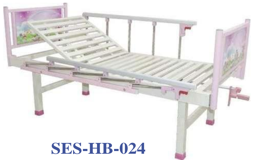
SES-HB-024 PEDIATRIC BED