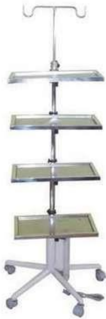
SYRINGE PUMP STAND SES-AI-004