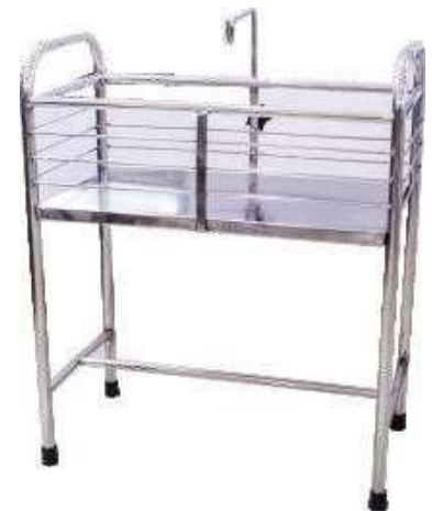
BABY COT SES-BC-004